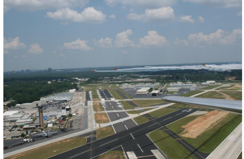
S.R. 283 (Sen. Brandon Beach) Senate Study Committee on Height Restrictions Surrounding Georgia Airports